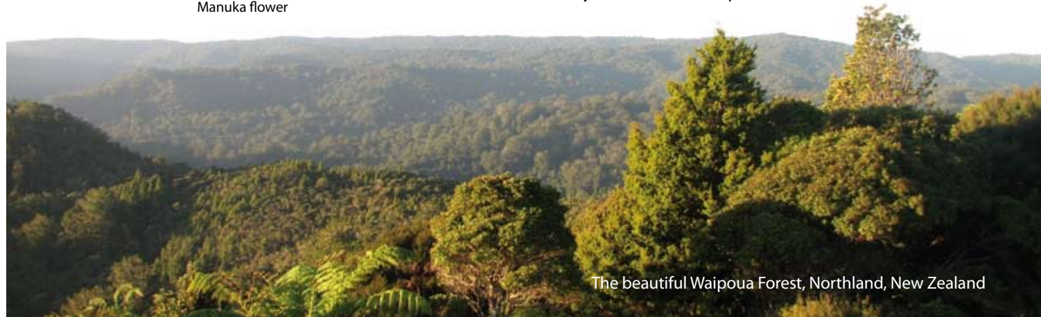
The beautiful Waipoua Forest, Northland, New Zealand

Our family has over 50 years experience in the beekeeping and honey industry and an enduring commitment to researching and promoting the extraordinary health properties of Northland Manuka. Our family, beekeepers and production staff can truly be described as experts in the field.